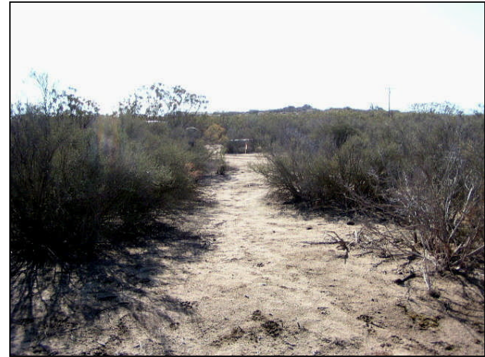
Photograph 4: View toward Lake Riverside candidate location, facing south.

Source: Michael Brandman Associates, 2008.