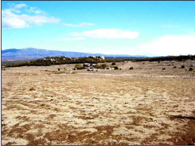
Photograph 5: View from Lake Riverside candidate location, facing northeast.