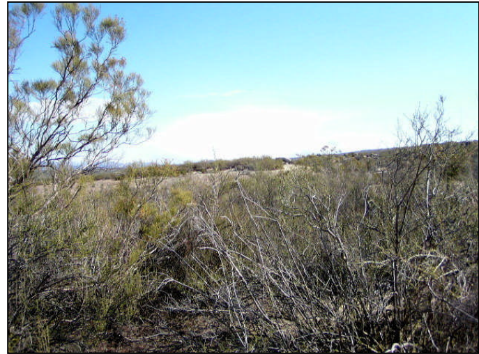
Photograph 8: View from Lake Riverside candidate location, facing east.