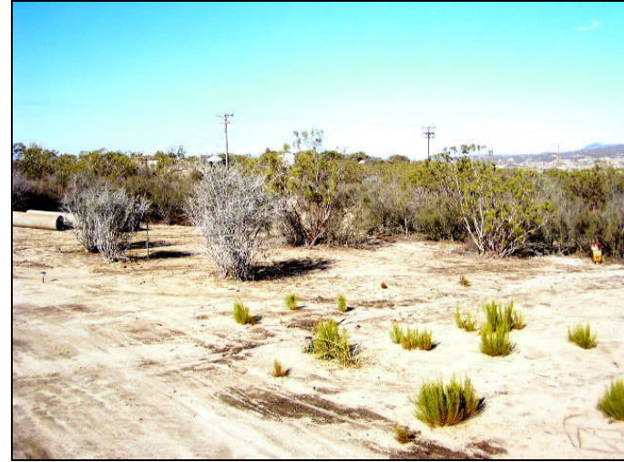
Photograph 2: Overview of Lake Riverside candidate location, facing northwest.