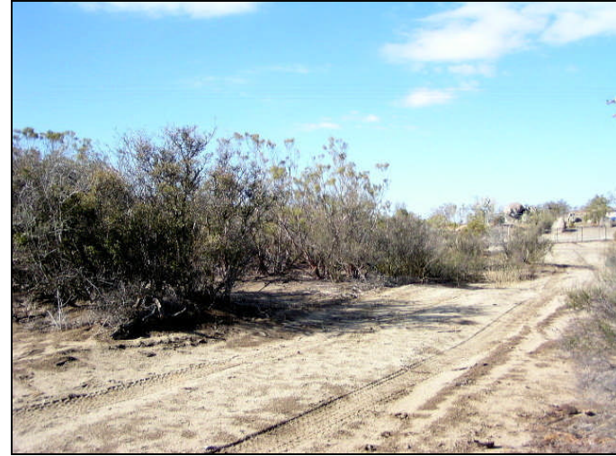
Photograph 6: View from Lake Riverside candidate location, facing west.