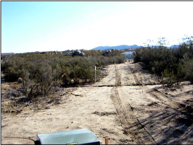
Photograph 3: View toward Lake Riverside candidate location, facing southeast.