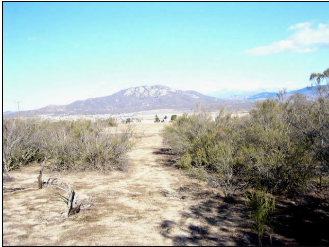
Photograph 7: View from Lake Riverside candidate location, facing north.