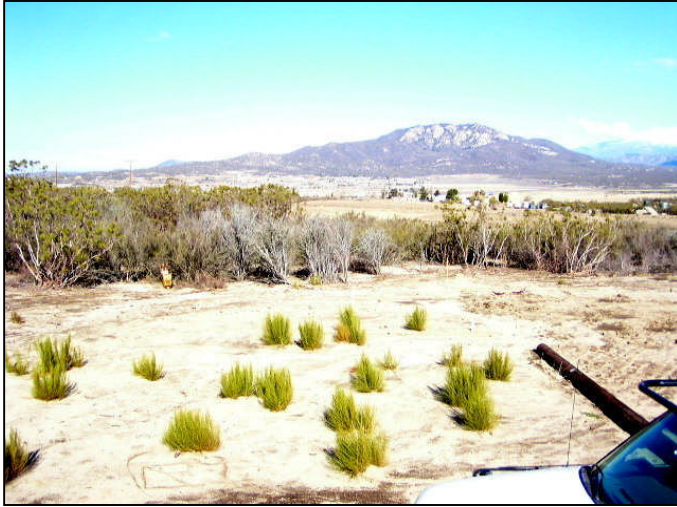
Photograph 1: Overview of Lake Riverside candidate location, facing west.